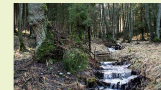
Streams are often surrounded by floodplain forests

Detailed studies at selected springs at the beginning and at the ending of the project will show whether the measures have had a positive impact on the composition of species in the habitats.