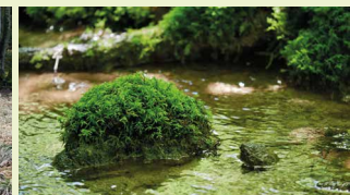
Calcareous tufa with curled hook moss