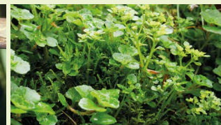
Curled hook moss and golden saxifrage