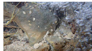
Caddisfly larvae on stone

Algae and moss, such as the curled hookmoss ( Palustriella commutata ), have a significant impact on the tufa formation due to their photosynthetic activity. The precipitated lime deposits on moss, stones and branches in the further course of the spring. Characteristic terraces of limestone and calcareous tufa arise due to alternate deposition of lime and regeneration of the moss.