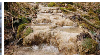
Terraces of limestone and calcareous